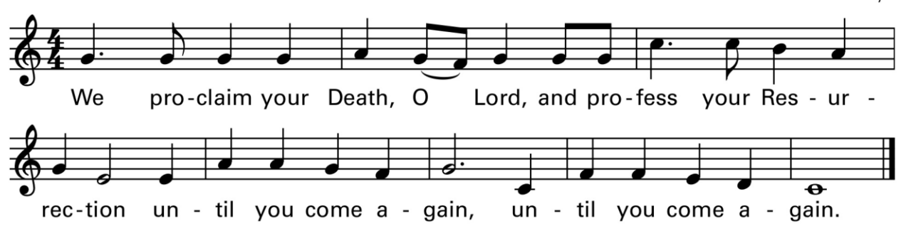
Text © 2010, ICEL. All rights reserved. Used with permission. Music © 2004, 2009, Randall DeBruyn. Published by OCP. All rights reserved.

Mass of the Resurrection Randall DeBruyn